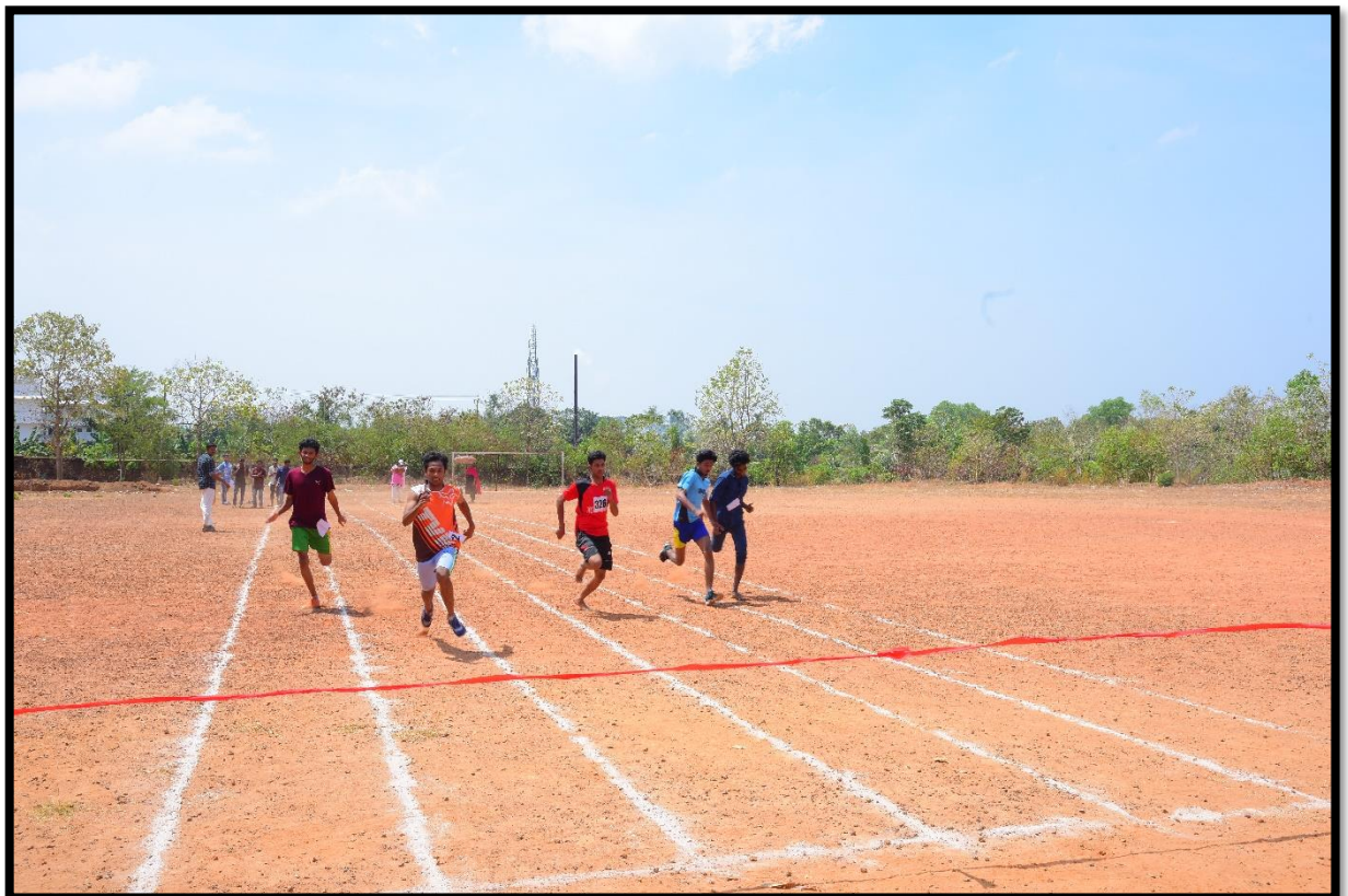
100m race for boys during Annual Athletic meet on 9th march 2018