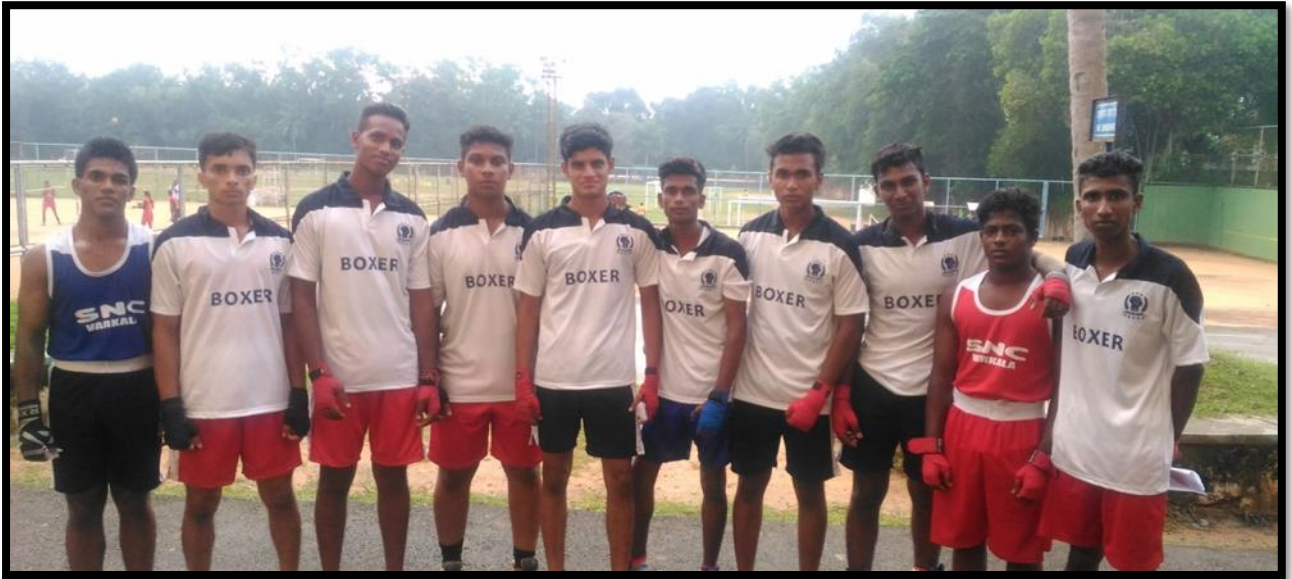
Medal winners-Kerala University inter collegiate boxing Championship for Men 15th October 2017