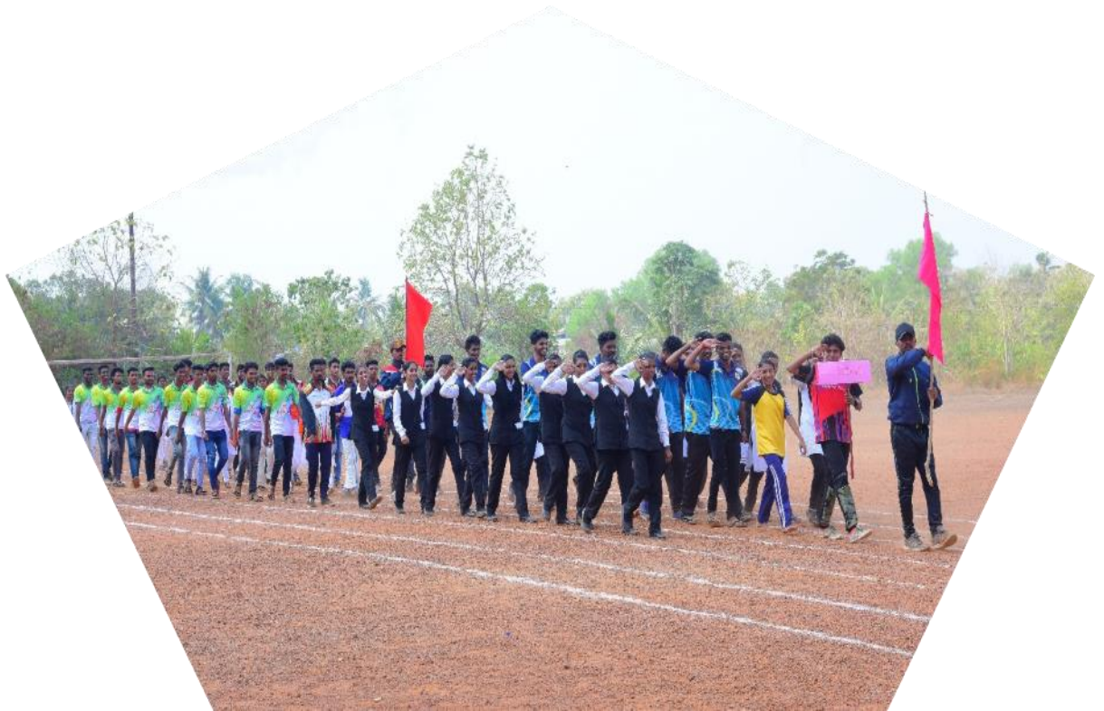
March past during Annual Athletic meet on 9th march 2018