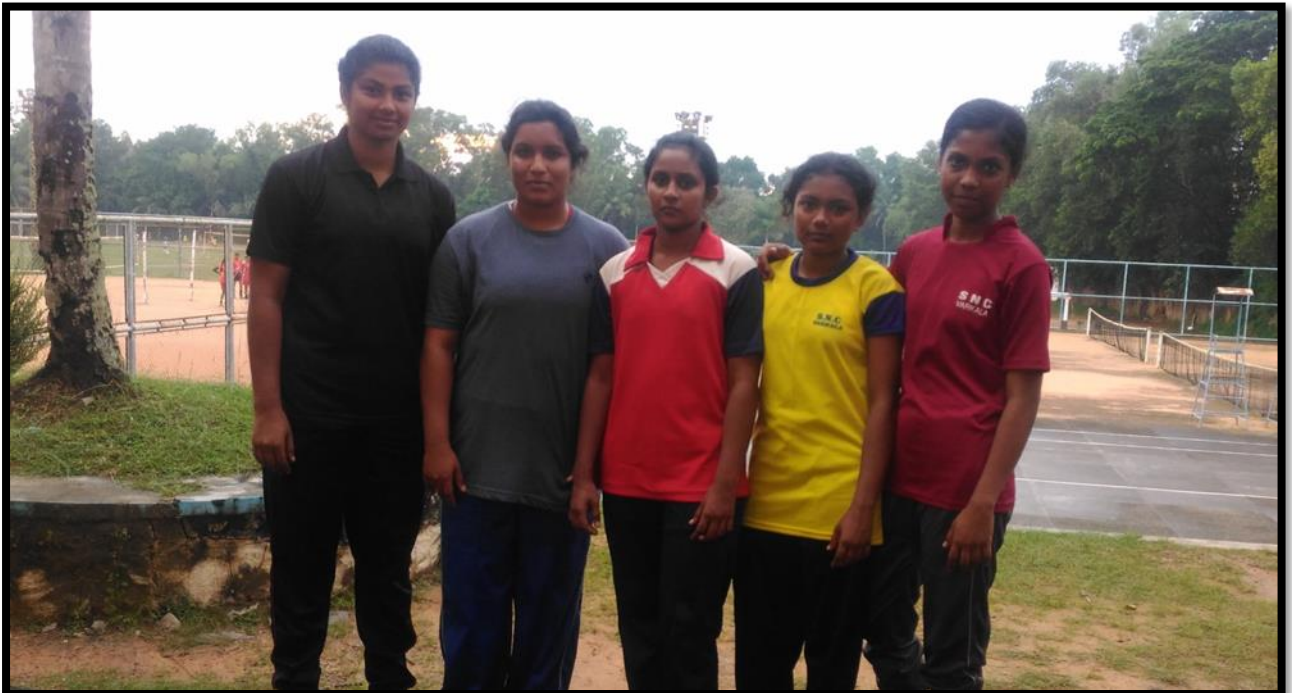
Medal winners-Kerala University inter collegiate boxing Championship for Women 15th October 2017