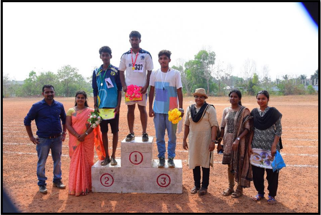
Crowning ceremony for the winners during Annual Athletic meet on 9th march 2018