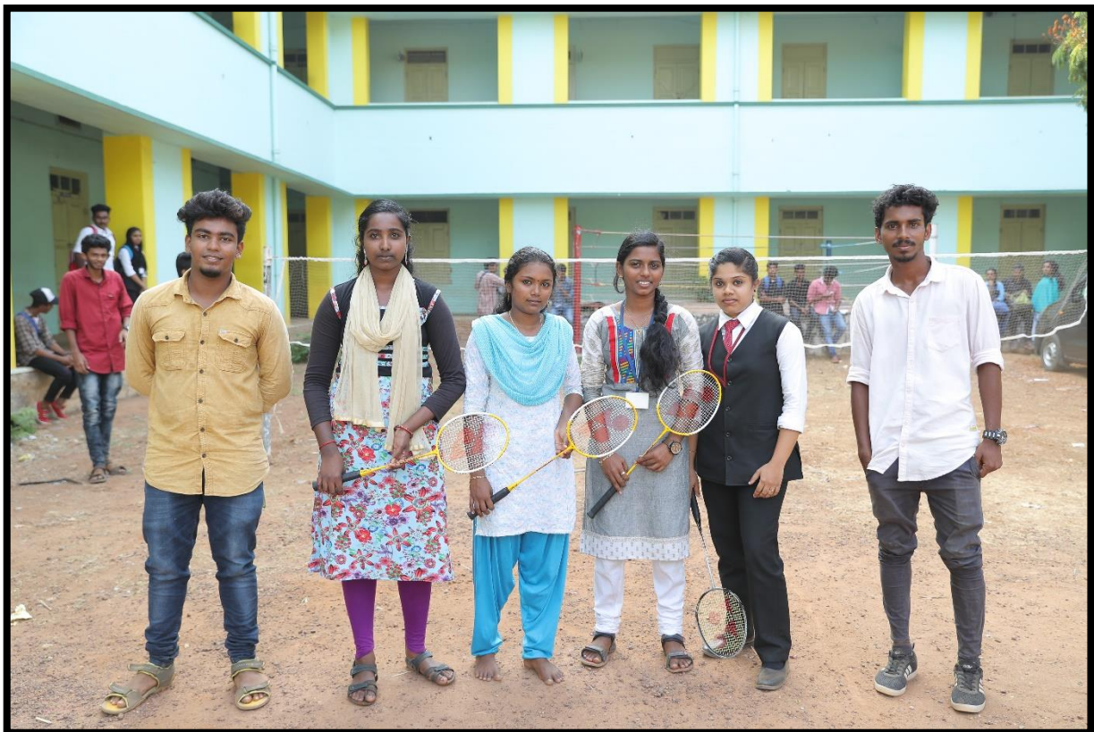
Badminton doubles teams posing before the competition with officials 26th February 2017