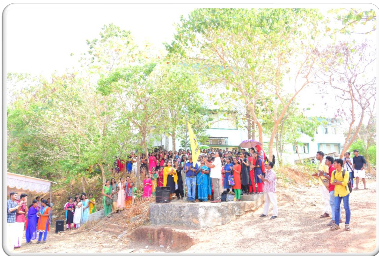
Flag hoisting by Principal Dr.L Thulaseedaran during Annual Athletic meet on 9th march 2018